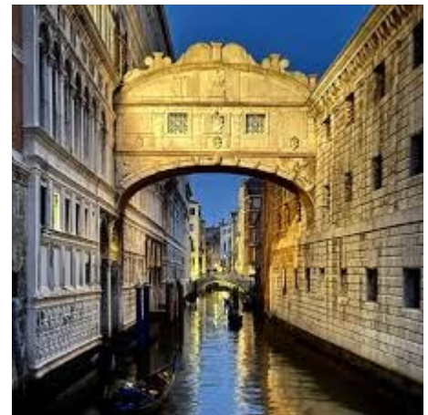
Pictured: The Bridge of Sighs located near the Doge's Palace in Venice, Italy.

lost in World War I, would meet; doing so as an expression of her unbreakable love. And so, the tradition began with people from all over the world attaching padlocks in the hope of sealing their love.