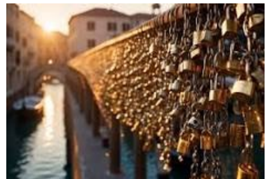
Pictured: Accademia Bridge in Venice, Italy